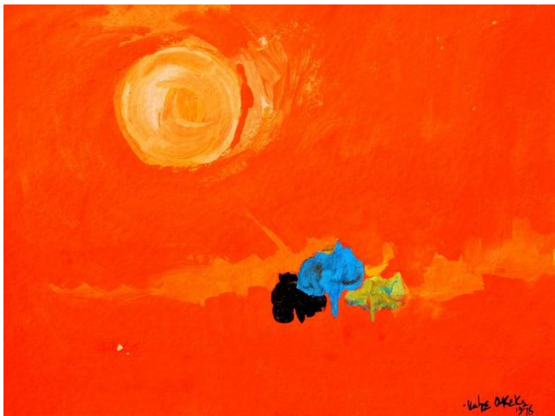
Asele Institute [editions] - Uche Okeke, Iford Textured Silk 270, Untitled, DSC_7515

Wherever you wander at the fair, don't be afraid to talk to exhibitors, gallerists and other experts. Their aim is to inspire enthusiasm about the artists they represent, not just sell their work. Most are genuinely excited by the pieces they showcase and will be delighted to discuss them, whether or not you plan to pull out your wallet.