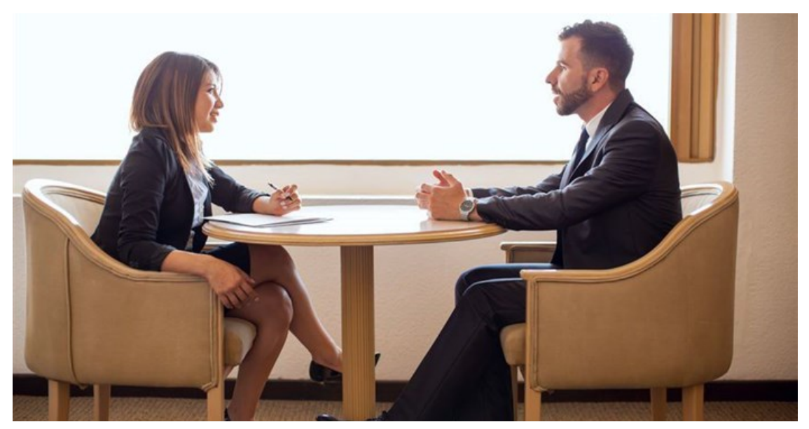
The face-to-face interviews - approximately 60 minutes in length per professional interviewee - results in a non-biased, academic-style view of the facts for the Agency Scope report

For the fifth time in South Africa, Agency Scope researchers are ready for the fieldwork required over the next four months to gather the data that will culminate in the collation, analysis and publication of a body of work that brings to light what marketers really think.