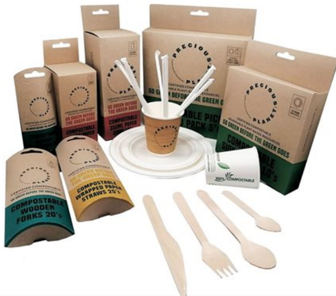
Precious Planet.