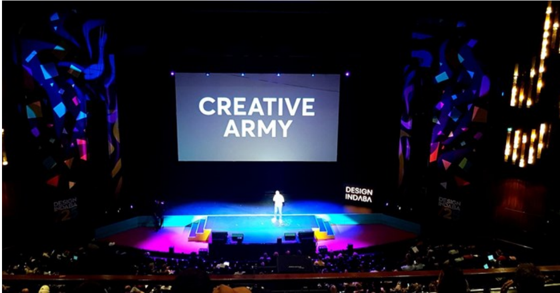
from Design Indaba 2020.