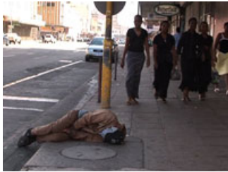
Scene from Glimpse

Two South African films will have their world premiers at the International Documentary Festival in Amsterdam (IDFA), in November. The two productions are 'Glimpse' and 'Angola: Saudades from the one who loves you'.