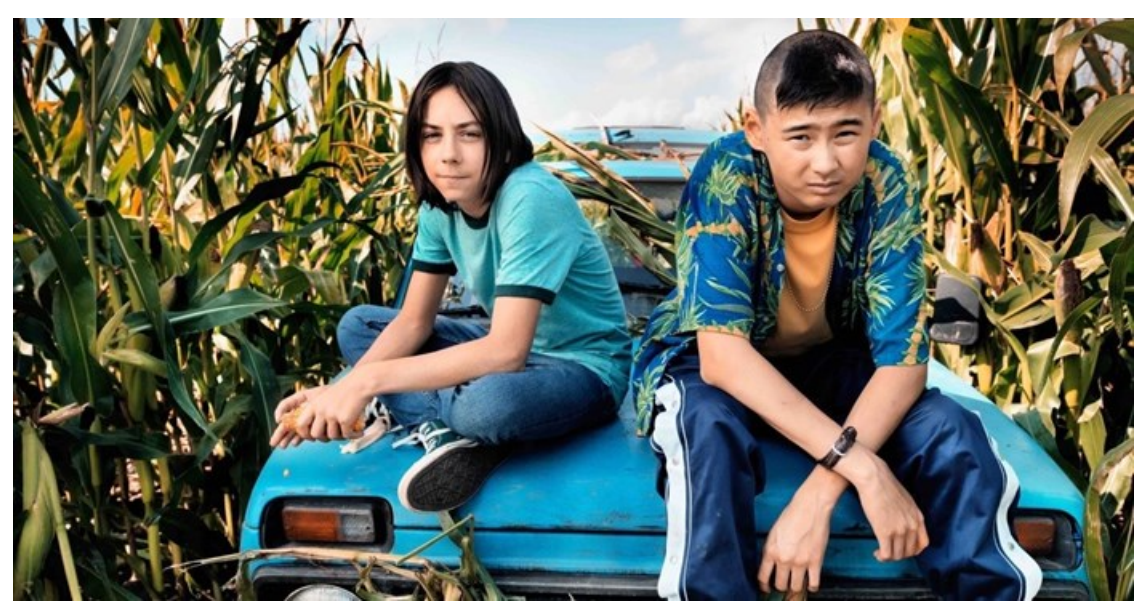
Goodbye Berlin film.

Ten German films by some of Germany's finest directors, a masterclass by German film industry professionals and networking sessions with the international film industry, form the focus of the 2017 Durban International Film Festival (Diff). Diff runs from 13-23 July 2017 in Durban.