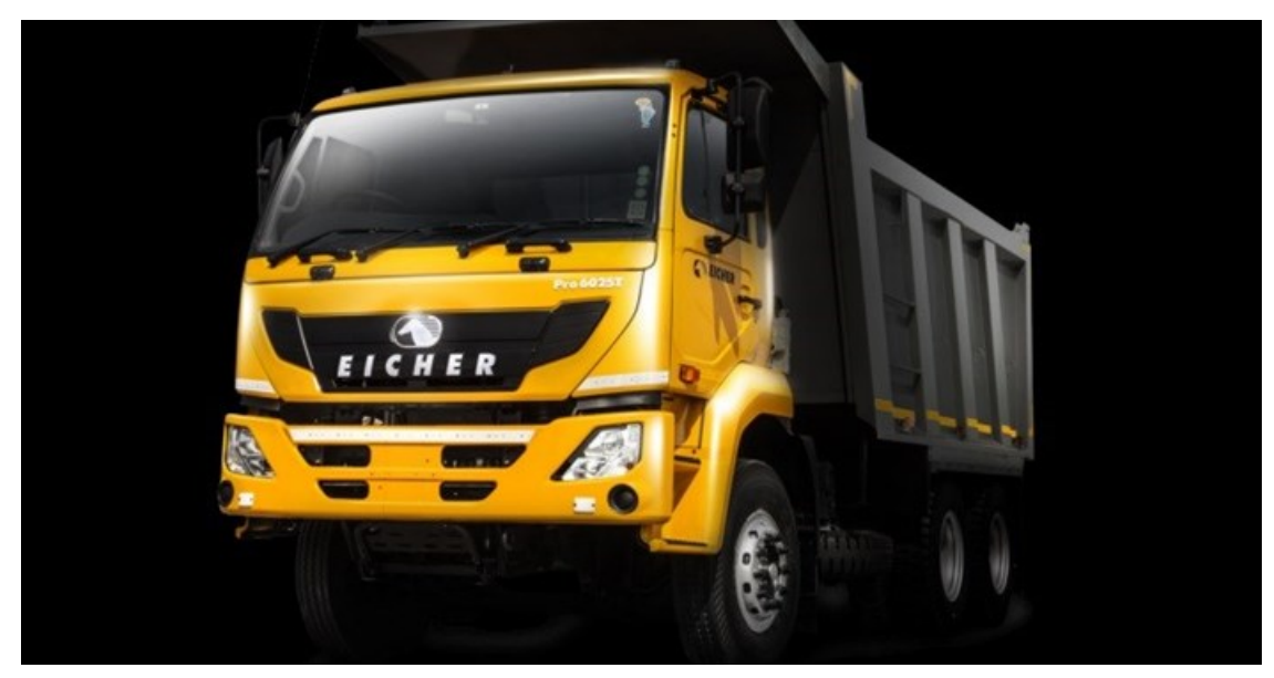
Eicher Pro 6025T

The Eicher brand has entered the heavy-duty commercial vehicle market in South Africa with the launch of its Eicher Pro 6000 series, next generation of heavy-duty trucks.