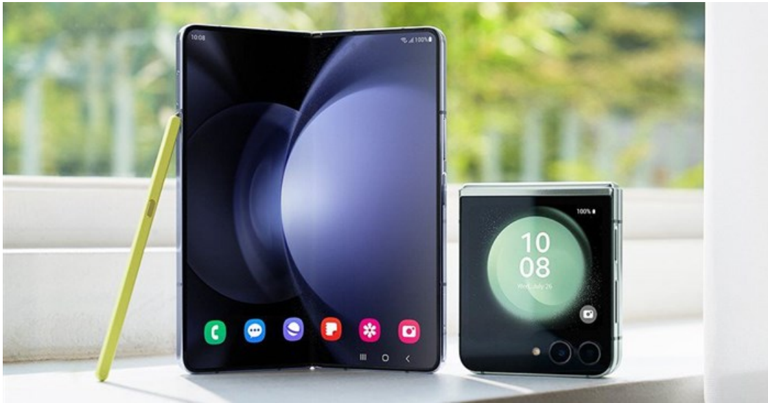
Samsung Galaxy Z Fold5 and Z Flip5.

Samsung South Africa hosted local media at Cracker Zac's in Rosebank for the unveiling of the new updates to its line of foldable smartphones. The biggest change for the 2023 Galaxy Z Flip5 and Fold5 are the Qualcomm Snapdragon 8 Gen 2 processor (inside the Galaxy S23 line as well), a new hinge design that allows for a more compact fold, and the Flip5 gets a bigger cover display.