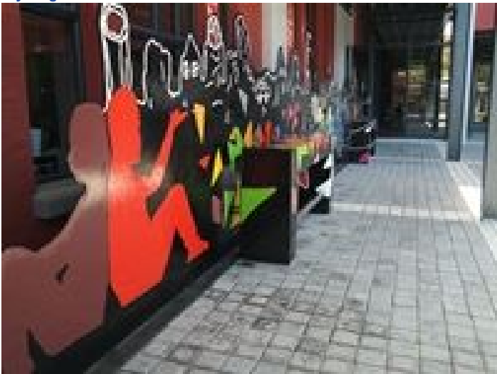
Artwork at the renovated Tramways Building