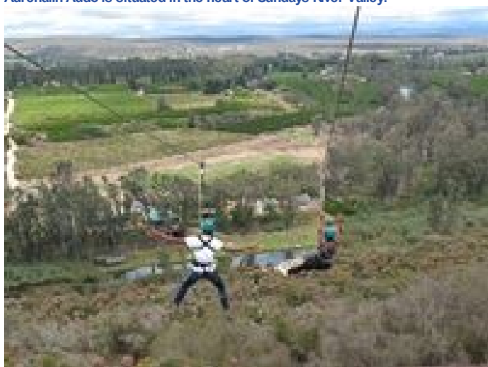
Double ziplining at Adrenalin Addo