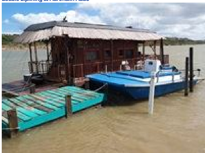
The Maggie May Party Boat cruises along the Sundays River.