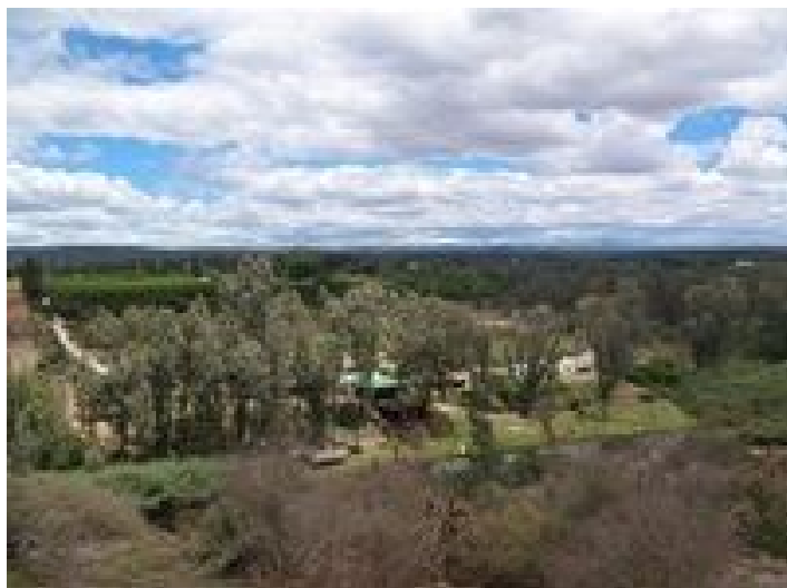
Adrenalin Addo is situated in the heart of Sundays River Valley.

Bizcommunity's whirlwind tour of what Nelson Mandela Bay has to offer domestic and international travellers included a trip to Adrenalin Addo, situated in the heart of Sundays River Valley, a drive out to the impressive Alexandria Dunefields where one can give sandboarding a go, a leisurely trip around Algoa Bay with Stampede Cruises, and a taste of the arts and culture scene in the city with stops at the Tramways Building, The Athenaeum, and GFI Art Gallery.