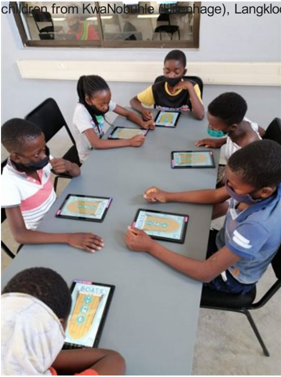
Great BOATS excitement at Good Work Foundation in Hazyview