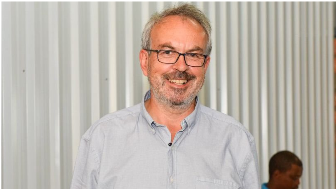
Prof Jean Greyling

“During the tournament, learners logged in from home to access the BOATS Android mobile coding app. They were taken through multiple choice questions that educated them about marine pollution and South Africa's cultural heritage. Up for grabs were TANKS school kits sponsored by LexisNexis South Africa, valued at R3,000 each. These kits introduce learners to coding concepts with the use of tangible tokens and image recognition, eliminating the need for a computer,” he explained.