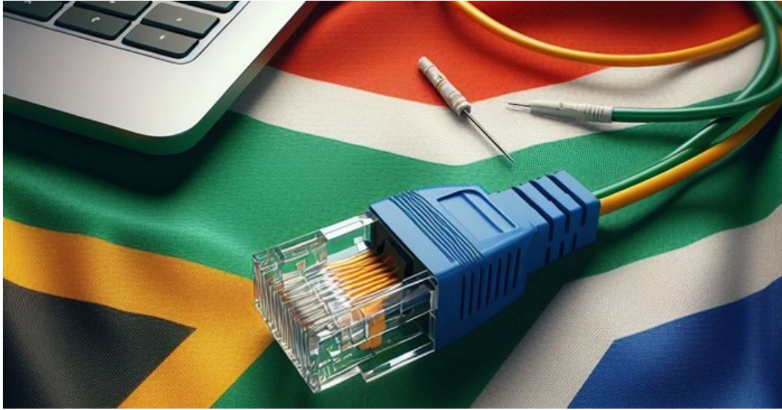
A tough day at the office for internet users in South Africa

Some chaos hit South Africa at lunchtime today as Microsoft battles a service outage across the Europe, Middle East, and Africa (EMEA) region that has left businesses and private users high and dry without access to cloud services like Microsoft 365, Teams, and Azure.