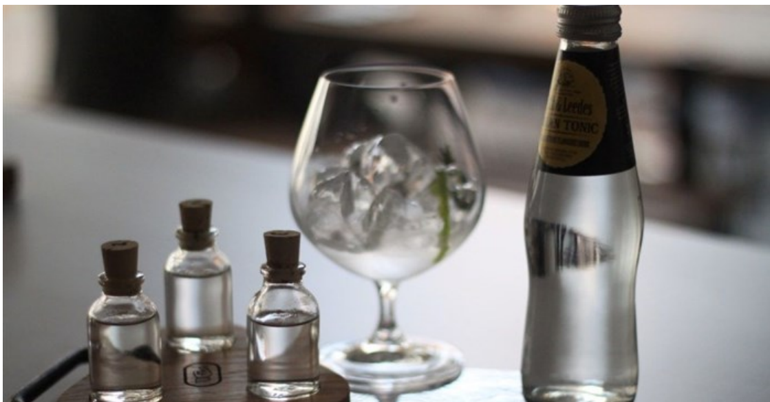
A tasting kit at Hope on Hopkins