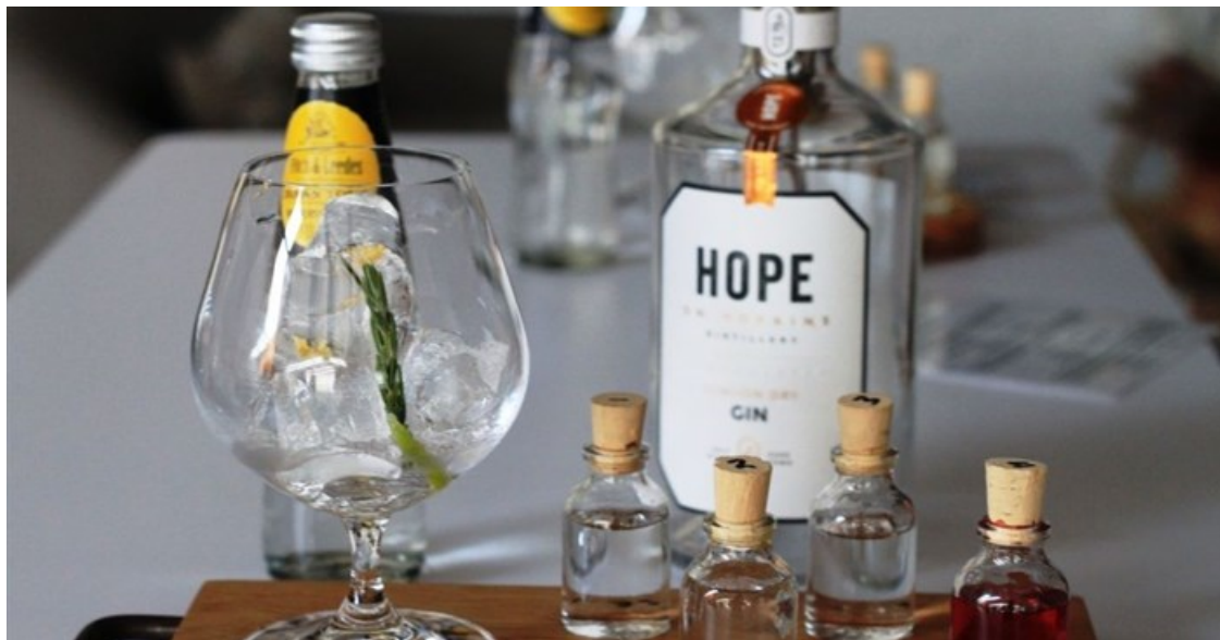
Hope on Hopkins gin

The Hope on Hopkins London dry gin is inspired by their time in London - symbolic of the typical gin style. It is refreshing and contains lemon verbena and rosemary botanicals. On the palate it is smooth and juniper strong, seeking an ideal garnish of lemon zest and fresh rosemary.