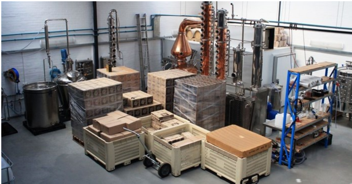
The tasting room overlooks the distillery.

This is no small feat and could only be accomplished by maintaining a strict schedule. Each gin company sends their bottles into the distillery where the gins are then created, bottles labelled and eventually distributed from the same location which also serves as a tasting room and their personal home space. Talk about multi-functional.