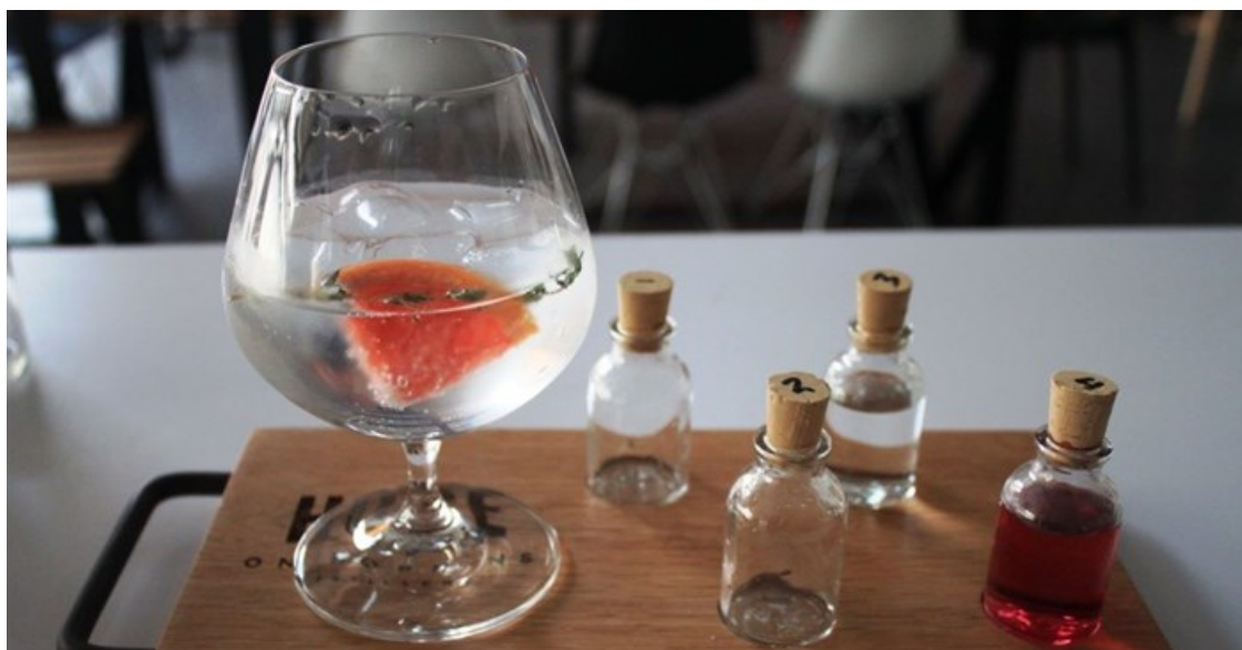
Salt River Gin (Image Supplied)

Buchu is such a strong flavour, they use only 35 grams to a 7.5-kilogram juniper berry ratio. It gives you an idea of how dominant the taste is. For this reason, Salt River gin is not served with a buchu garnish but rather with fresh thyme and frozen grapefruit. For any gin connoisseurs who are interested in sipping this spirit undiluted, you will get hints of the almost medicinal taste of buchu. With the addition of a good tonic, it becomes almost woody and floral with a dry mouthfeel.