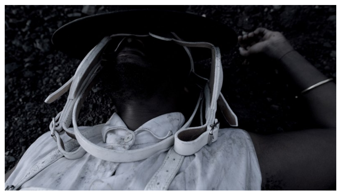
To Move Mountains (Video Still 6), 2015-16

It began when I was a child at home but it became real for me when I realised I had an ability that other people could recognise. That was in primary school.