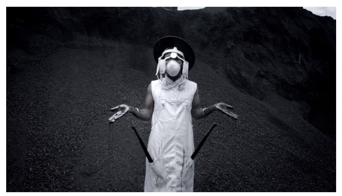
To Move Mountains (Video Still 5), 2015-16