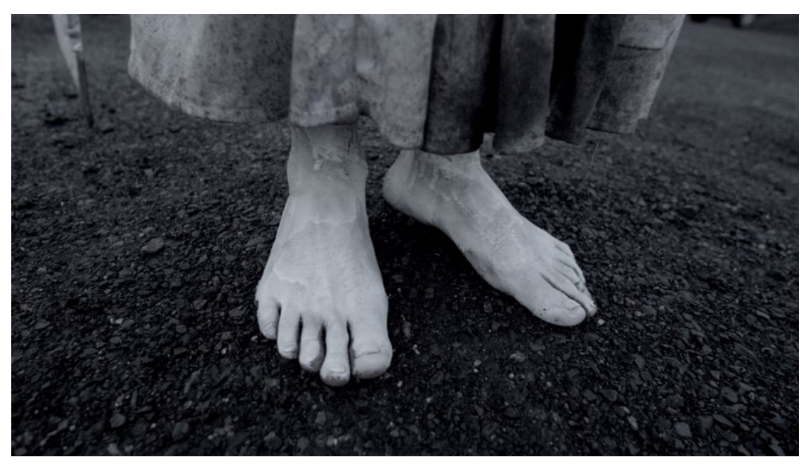
To Move Mountains (Video Still 1), 2015-16

I like that the work takes an archaeological approach to engaging the many layers of history.