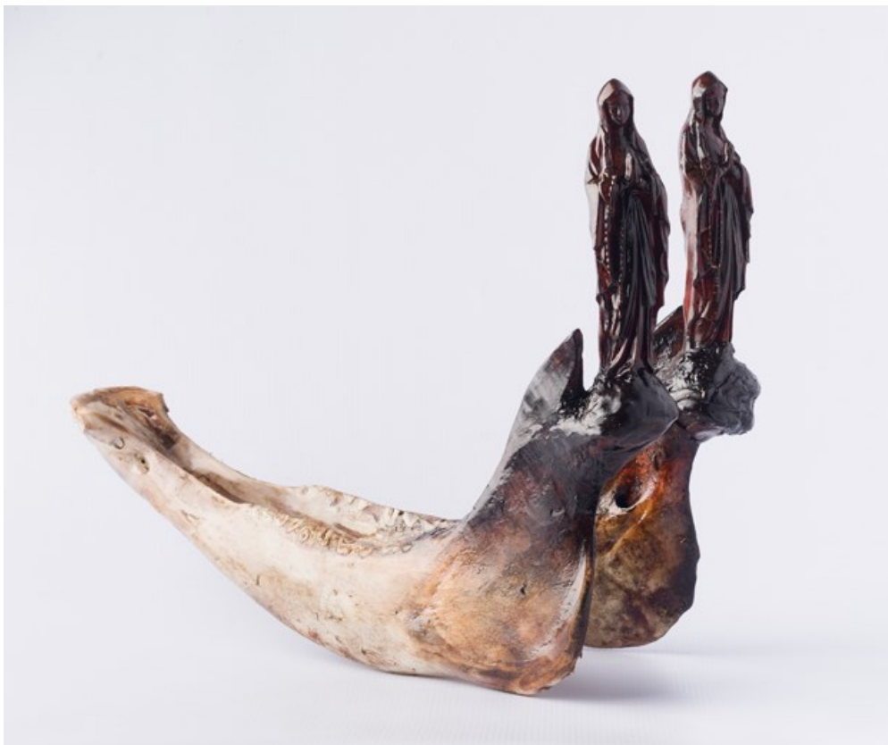
Lwandiso Njara - They came from across the water (scene-2)

It is difficult to isolate within a fair that is showcasing so many artists. What I can say is that we have different sections and on entering you will find Tomorrows/Today, which is a curated section presenting 10 individual projects by artists from Africa and the diaspora. Tomorrows/Today explores the ideas inspired by African modernity. These works demonstrate an intense awareness of the changing social and economic landscape defining the various localities on the continent. These artists reflect on current conditions in ways that escape fixed definitions about African realities. It is a great introduction to an artist body of work.