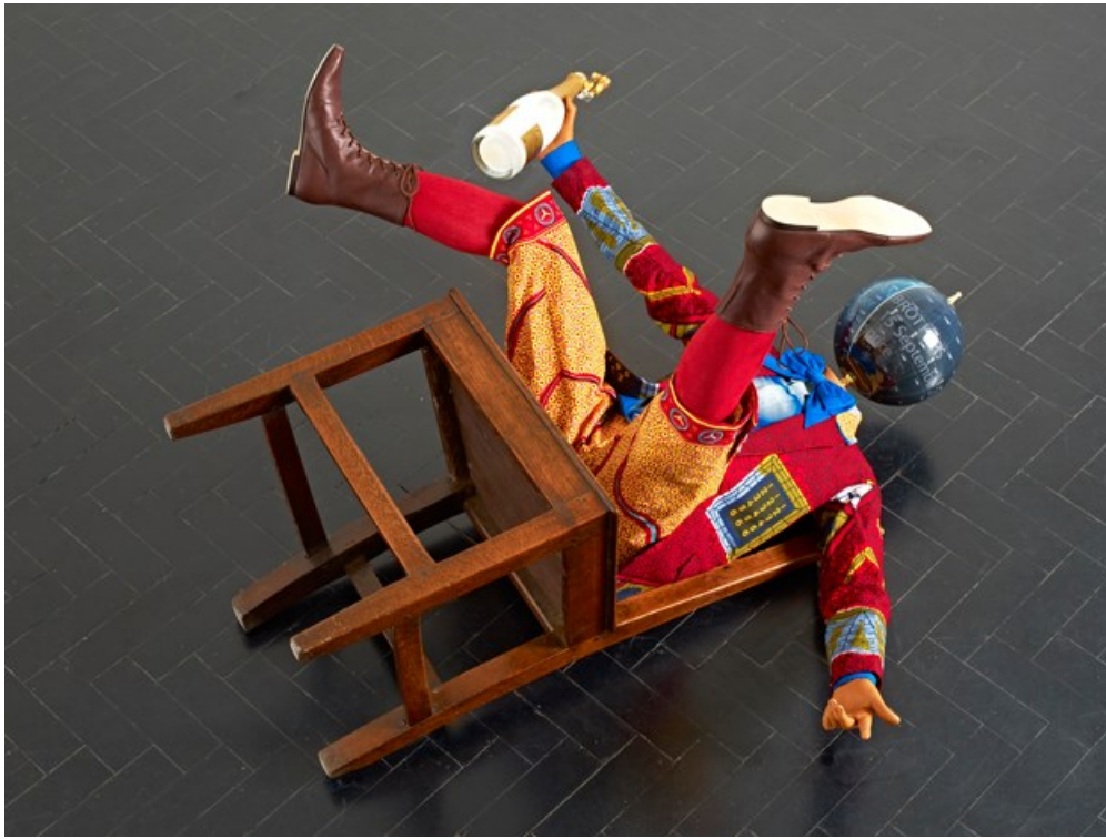
Yinka Shonibare MBE - Champagne Kid (Fallen) 1 2013

■ Is the CTAF affiliated with LIVE ART or the Public Art Festival also taking place in Cape Town this month?