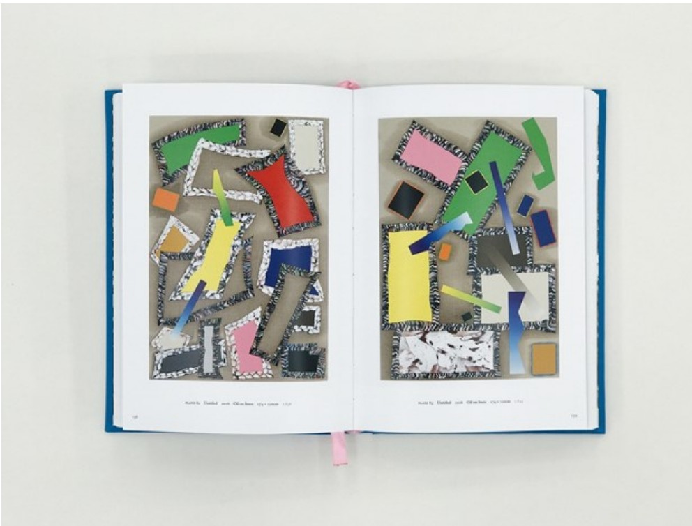
Zander Blom- Painting Volume II 2013

It is hard to select one over the other, because all the works present different perspectives. The best approach is to question my response to what I'm confronted with. This way I can appreciate the works based on its individual merits.