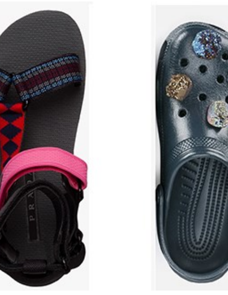
Christopher Kane's Crocs and Prada's Teva style sandal.

To paraphrase a quote commonly <u>misattributed</u> to Marilyn Monroe, "If you give someone the right pair of 'pretty ugly' shoes, they can conquer the world."