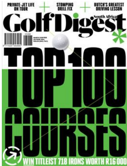
Golf Digest, March 2018, Top 100 2018 cover

In February 2018, New Media will release the 268th issue of Golf Digest , making it one of the country's longest running sports magazines. The March issue (on shelf from 19 February) is the iconic Top 100 Edition. The prestigious course ranking was first published in 1998, and this year will mark its 20th anniversary.