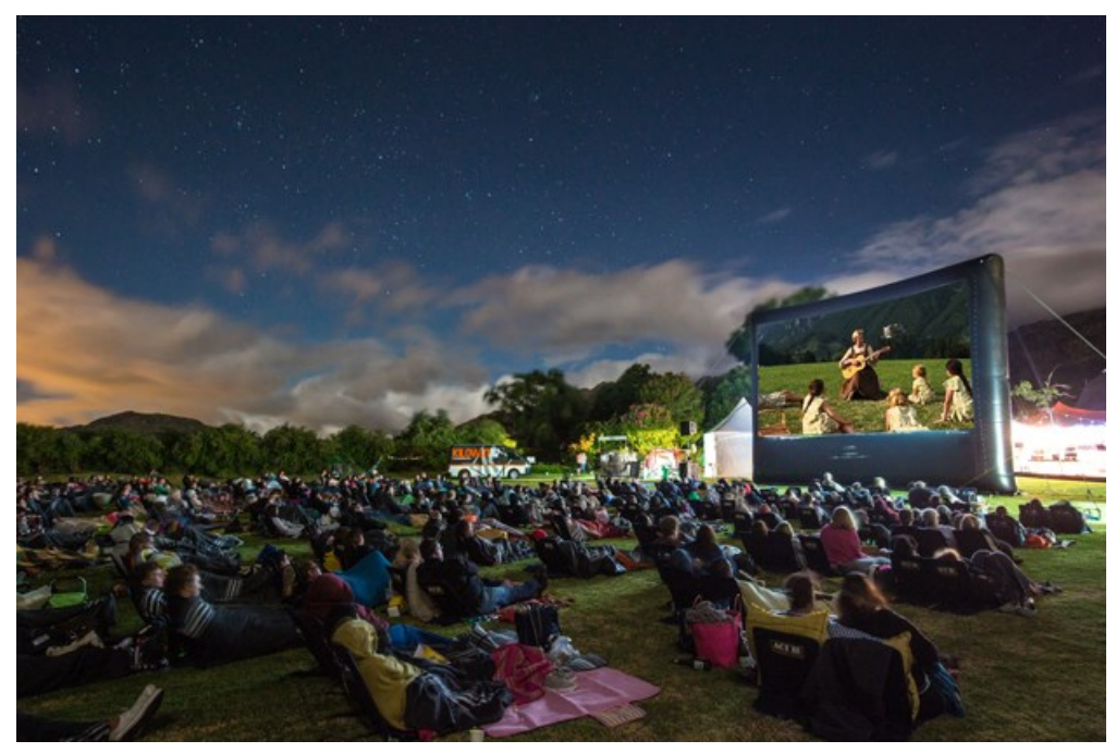
Galileo Open Air Onema

2017 will see experiential companies and many other event companies and production houses and agencies creating concepts around the following: