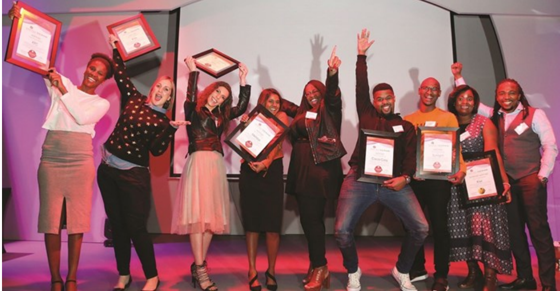
Ask Afrika Icon Brands Top 10 winners on stage.

The winners of the 2018/2019 Ask Afrika Icon Brands Awards were announced at a conference that took place at The Venue in Melrose Arch on 21 August 2018.