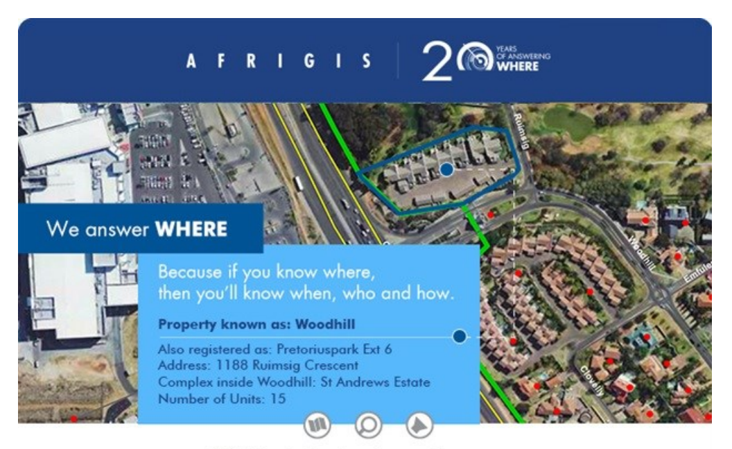
AfriGIS is a technology innovation company We give easy access to quality location information and insights .

You can only get better results if you know exactly where your customers are. Accurate, geomapped addresses provide better data quality and results.