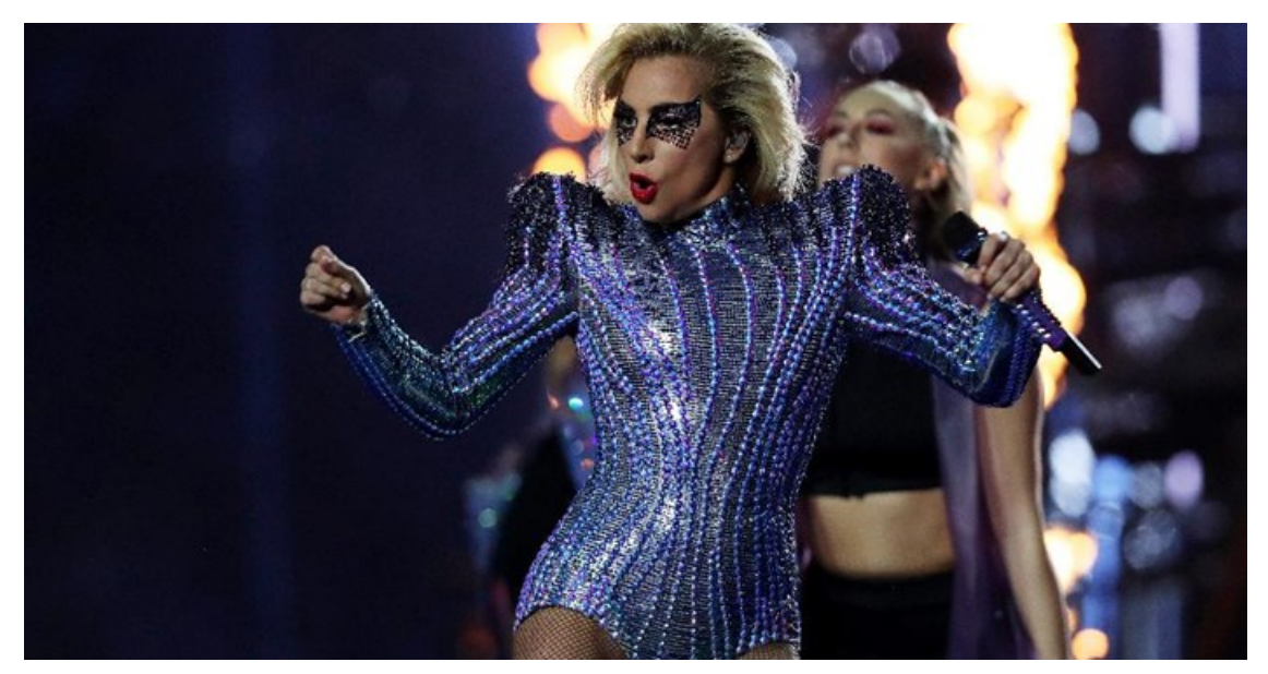
Lady Gaga rocks the Super Bowl half time show

We are entering a new era of brand activism as brands step up to speak out against political decisions they feel are morally wrong or to uphold the values of a democratic society. This was strongly apparent at America's stellar sporting show, the Super Bowl on Sunday, where it was all about the message and creativity in the advertising spectacular aligned to it.