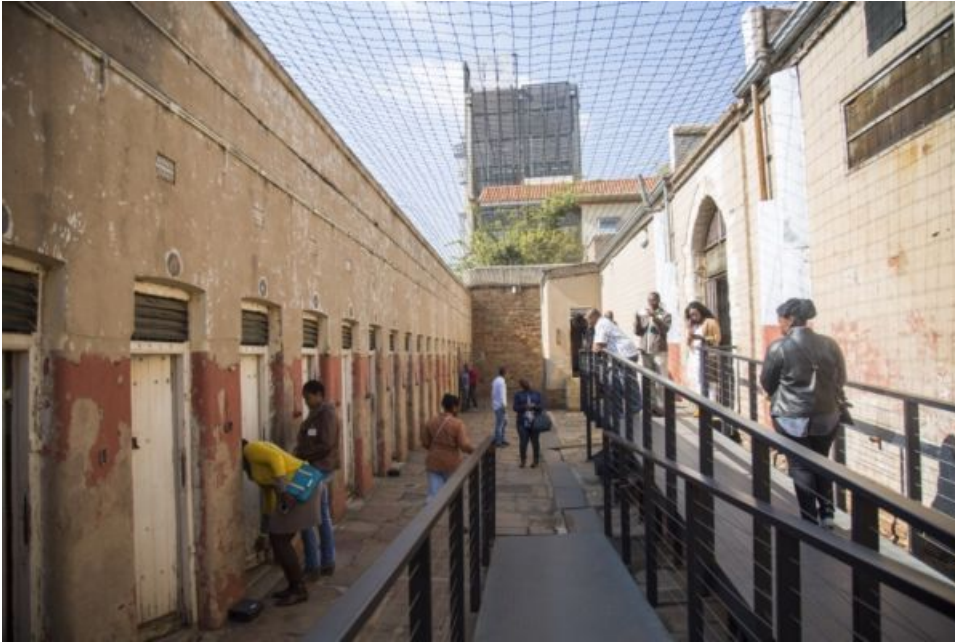
Visitors explore the isolation cells at Number Four.

With the launch of an innovative app, one of South Africa's most popular and important heritage sites have become even more accessible. Visitors can now tour this sprawling precinct with a virtual guide, the Constitution Hill Guide.