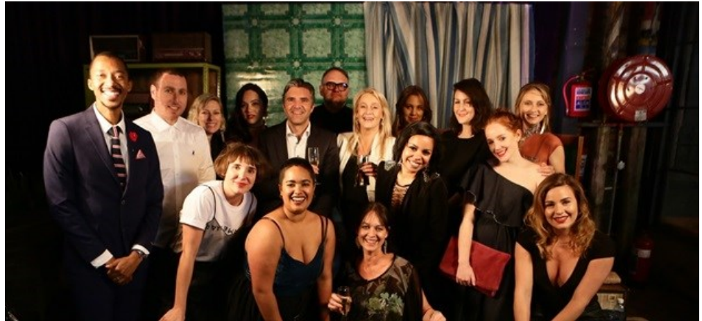
Team Spree in celebratory mode.

She also feels there is a lot of exceptional digital work at the moment, which is why they couldn't be prouder to be amongst the winners on the night, while also consistently being recognised in the category of e-commerce sites, year after year.