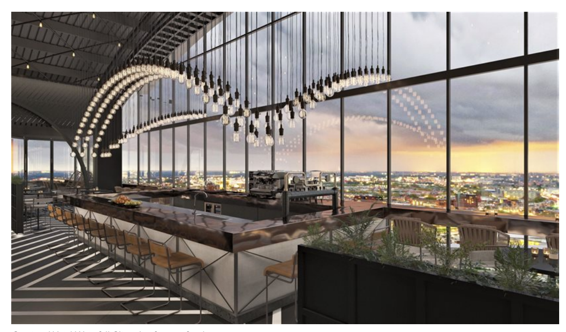
Courtyard Hotel Waterfall City - view from rooftop bar

Total revenue decreased by 25% to R1,16bn, while operating costs excluding depreciation decreased by 24%. Excluding the implementation of IFRS 16 Leases, the reported operating costs decreased by 11%, mainly due to the cost containment measures put in place from April to mitigate the extent of the losses arising from minimal revenues. Excluding the effects of IFRS 16 Leases, normalised headline EBITDA margin decreased by 12 percentage points to 20%.