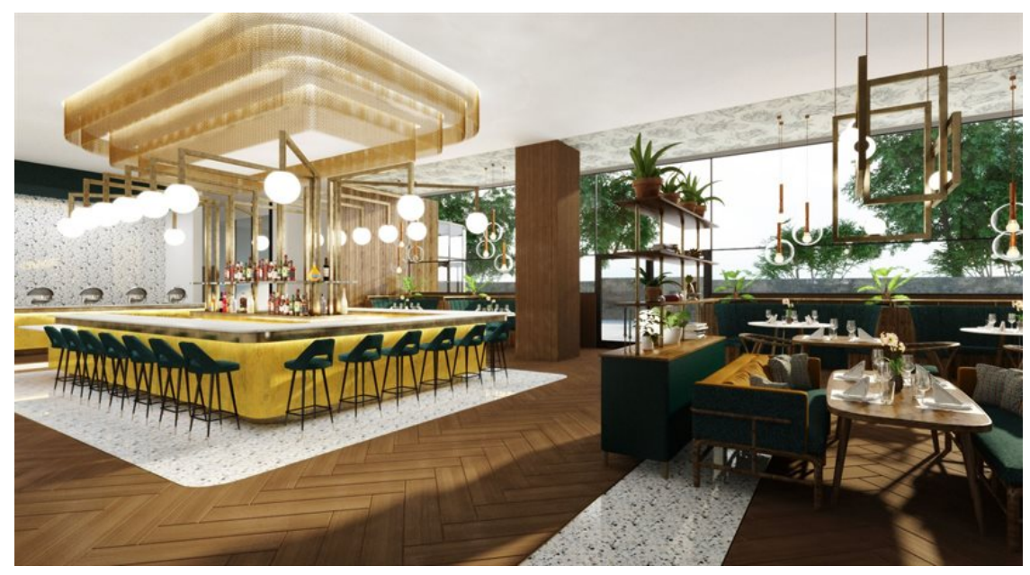
Courtyard Hotel Waterfall City - restaurant

On completion of Courtyard Hotel Waterfall City and City Lodge Hotel Maputo, the group will offer 8070 rooms at 63 hotels in six countries.