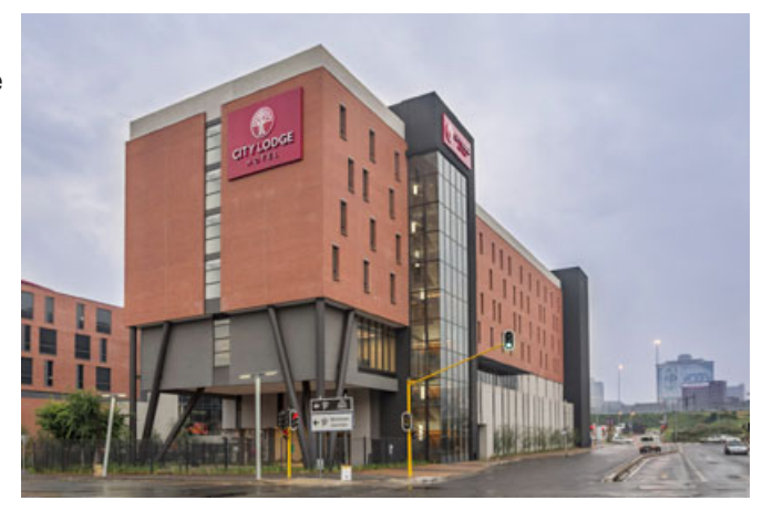
City Lodge Hotel Newtown

The group's share price rose from R63.96 to R162 over this period.