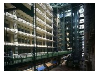
Eastgate interior.

This article is republished from The Conversation under a Creative Commons license. Read the original article .