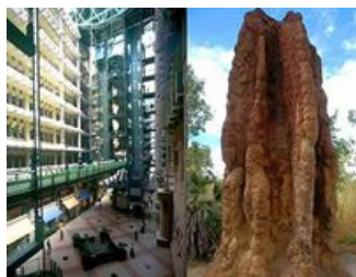
Eastgate mound.

Sustainability in developing African cities requires closer attention to organic and vernacular models. The “termite mound”-inspired Eastgate Centre in Harare, Zimbabwe is an example of sustainable architecture, inspired by a biomimetic model.