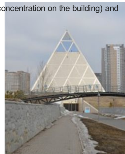
Palace of Peace, Astana.