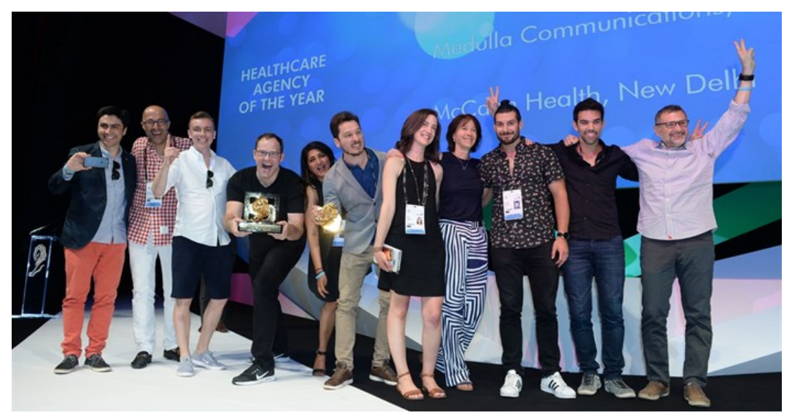
Cannes Lions' Healthcare agency of the year: Area23, New York.

The 64th annual Cannes Lions Festival of Creativity kicked off on 17 June with the Cannes Pharma and Cannes Health & Wellness Lions award ceremonies, where Y&R SA did SA proud!