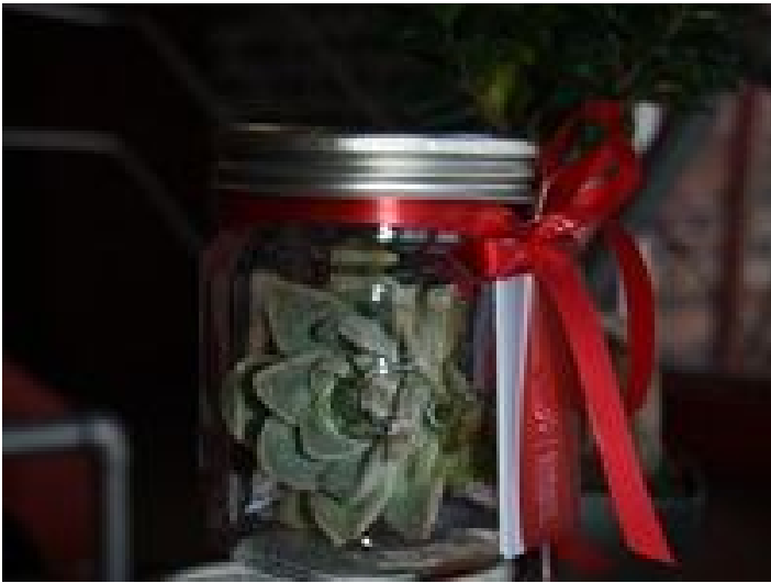
Nurturing and growing potential