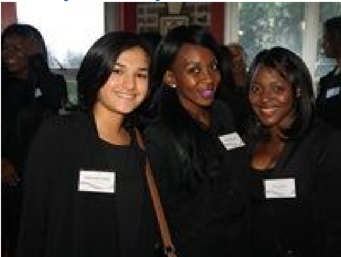
Phakama 2015 candidates