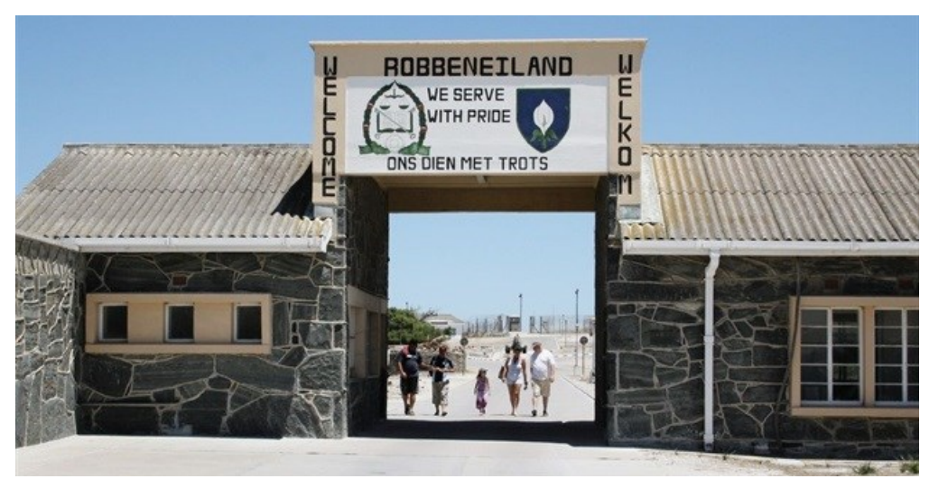
Robben Island, Cape Town.

Newswatch: Trustees of the CEO SleepOut have <u>apologised in a group statement</u> for any offence caused after its 'Robben Island room bid' came under fire on social media this week.