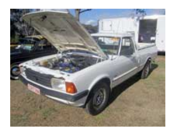
A 1981 Cortina Bakkie

During the latter years of apartheid, SA built more tanks than any other country on earth. Factories around the country churned out tens of thousands.