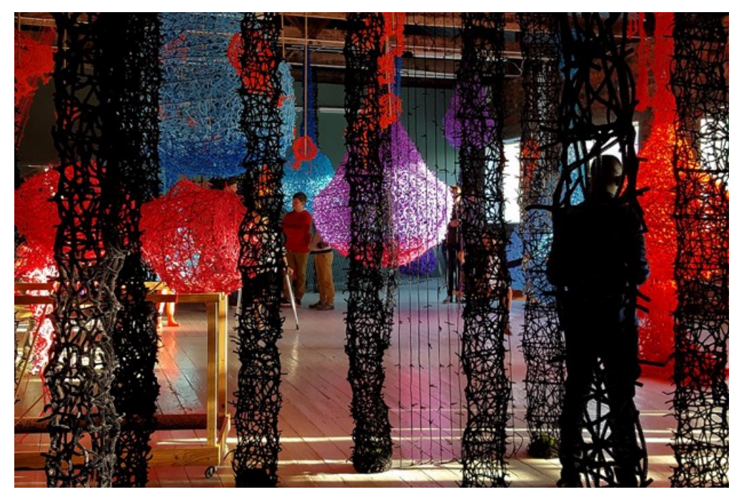
Liza Grobler - Barbed Wire Paradise - Immersive spatial drawing in mixed media 2016.

Witness the emerging talent from the African continent and the diaspora - Tomorrows/Today gathers new provocative voices reflecting on our contemporary realities. Each artist has a solo presentation and there will be an award presented on Sunday at 18.00 forming the closing ceremony of the fair.