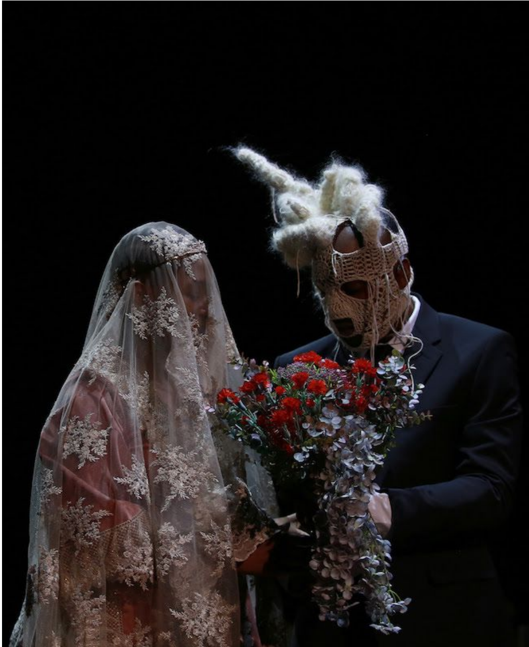
Brett Bailey's Samson

Brett Bailey's much-anticipated Samson (theatre) puts the biblical story of Samson through a sensational treatment, bringing it into the 21 st century to explore the global underbelly of political extremism, inequality and violence.