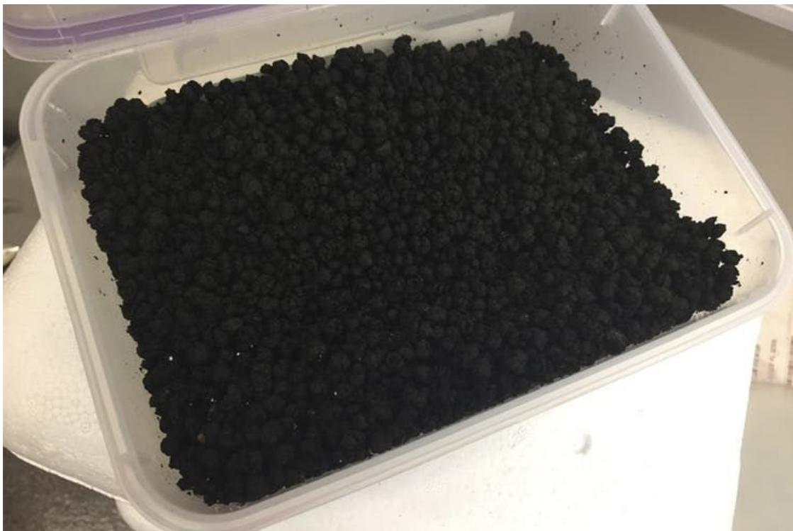
Biosolids after collection from a waste treatment facility.

Is this the end? Not yet. So far we can only remove 50% of heavy metals but we hope to shift this to 80% with improved experimental designs. My team is currently conducting small laboratory and field experiments to explore whether our new strategy will work on a large scale. One lesson I would like to share with everyone: Be observant. For any problem, the solution may be just around you, in your home, your office, even in the appliances you are using.