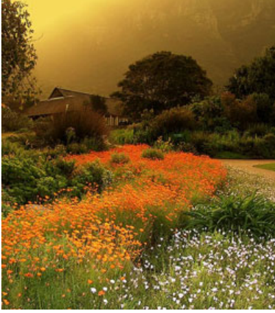
Kirstenbosch Gardens, a consistent winner at the Chelsea Show

Kirstenbosch has done it again - winning yet another gold medal, its 31st - at the Chelsea Flower Show in the UK. Let's celebrate.