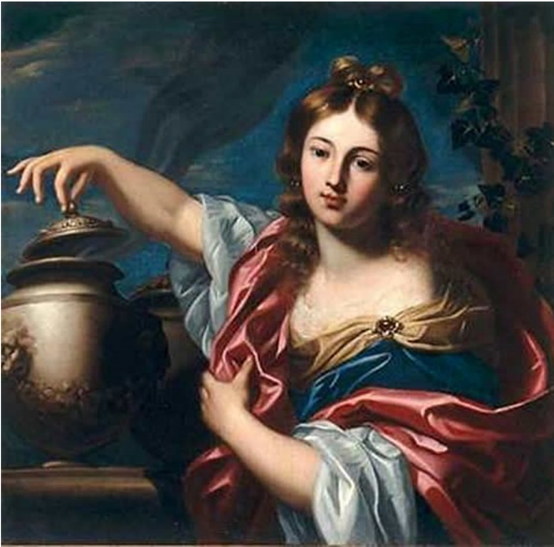
Contrary to popular belief that stems from a mistranslation, Pandora did not open a box, but rather, a jar.

Fire can literally mean, what we braai our meat on or what we used to become bronze-aged man, but also represents the internal fire of self-consciousness, creativity, and innovation. If you look at this story through a modern lens we can all agree that the gods were wrong to deny mankind our independence, our enlightenment, our fire.