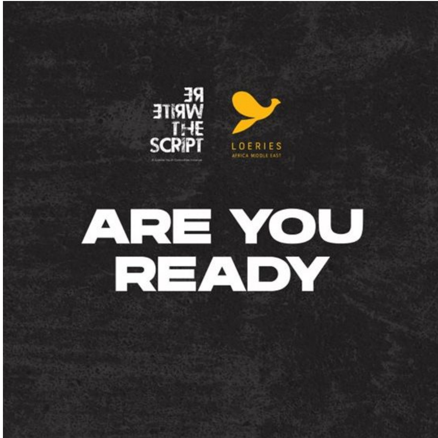
Image supplied. The Rewrite the Script 2022 LYCs campaign has launched on Instagram

The Rewrite the Script campaign by the 2022 Loeries Youth Committee (LYC) has launched on Instagram.