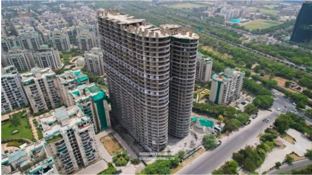
The Apex and Cayenne towers are 103m and 97m high respectively.

The controlled implosion of the Supertech Twin Towers in Noida, Uttar Pradesh, near India's capital New Delhi, took place in late August. The project was a collaboration between Mumbai-based Edifice Engineering and Jet Demolition.