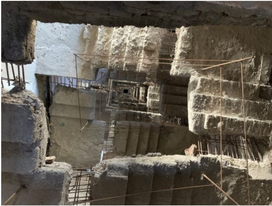
Pre-weakening of the stairways.