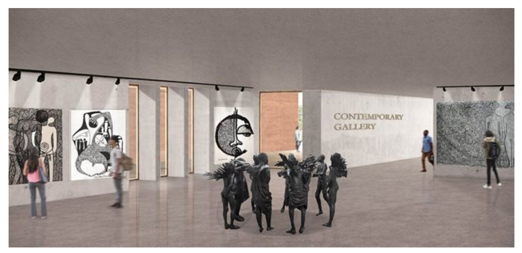
Contemporary gallery.

Educational partnerships with universities, technical institutes as well as schools and young learners will further generate local involvement in the project and will seek to develop archaeological expertise through both practical experience and theoretical training.