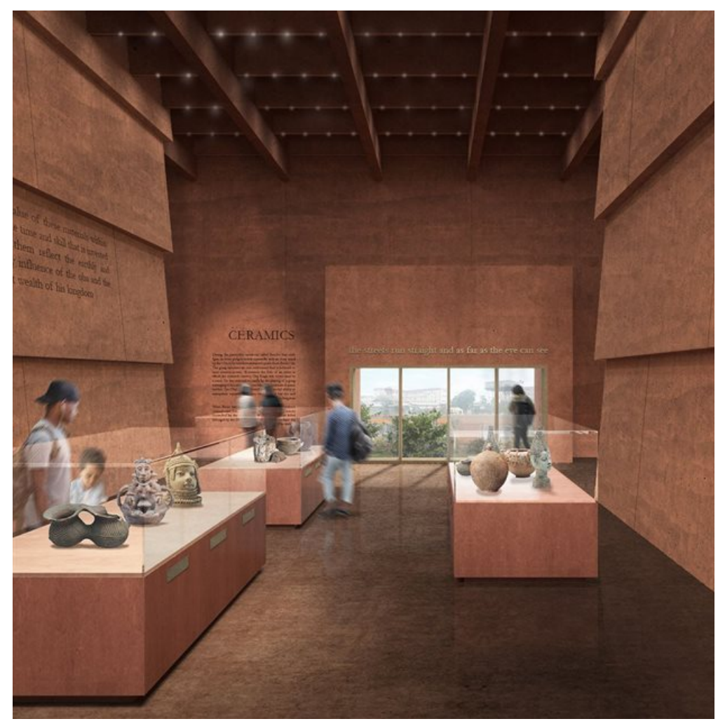
Ceramic gallery.

"The open dialogue that this project fosters will create new opportunities to address the significant history of the Kingdom of Benin, but also the painful history of the invasion and destruction of Benin City by British forces in 1897 – and to engage in new forms of cultural exchange and understanding."