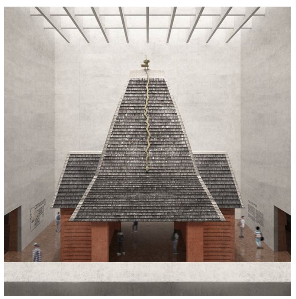
Reconstructed Royal Spire Pavilion.

typology – within each of which sit pavilions which take their form from fragments of reconstructed historic compounds. These fragments allow the objects themselves to be arranged in their pre-colonial context and offer visitors the opportunity to better understand the true significance of these artefacts within the traditions, political economy and rituals enshrined within the culture of Benin City.