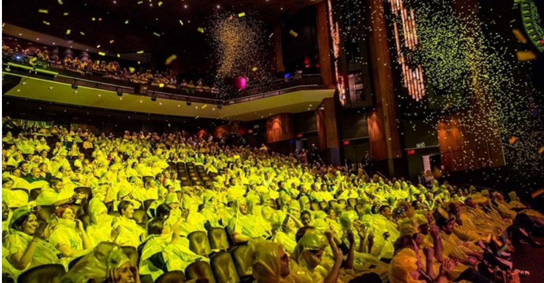
Design Indaba 2016.

The Design Indaba Conference, which will be held from 21-23 February 2018, is going beyond design to create a multi-sensory event where you can hear, see, learn and experience the future of creative thinking and design activism.