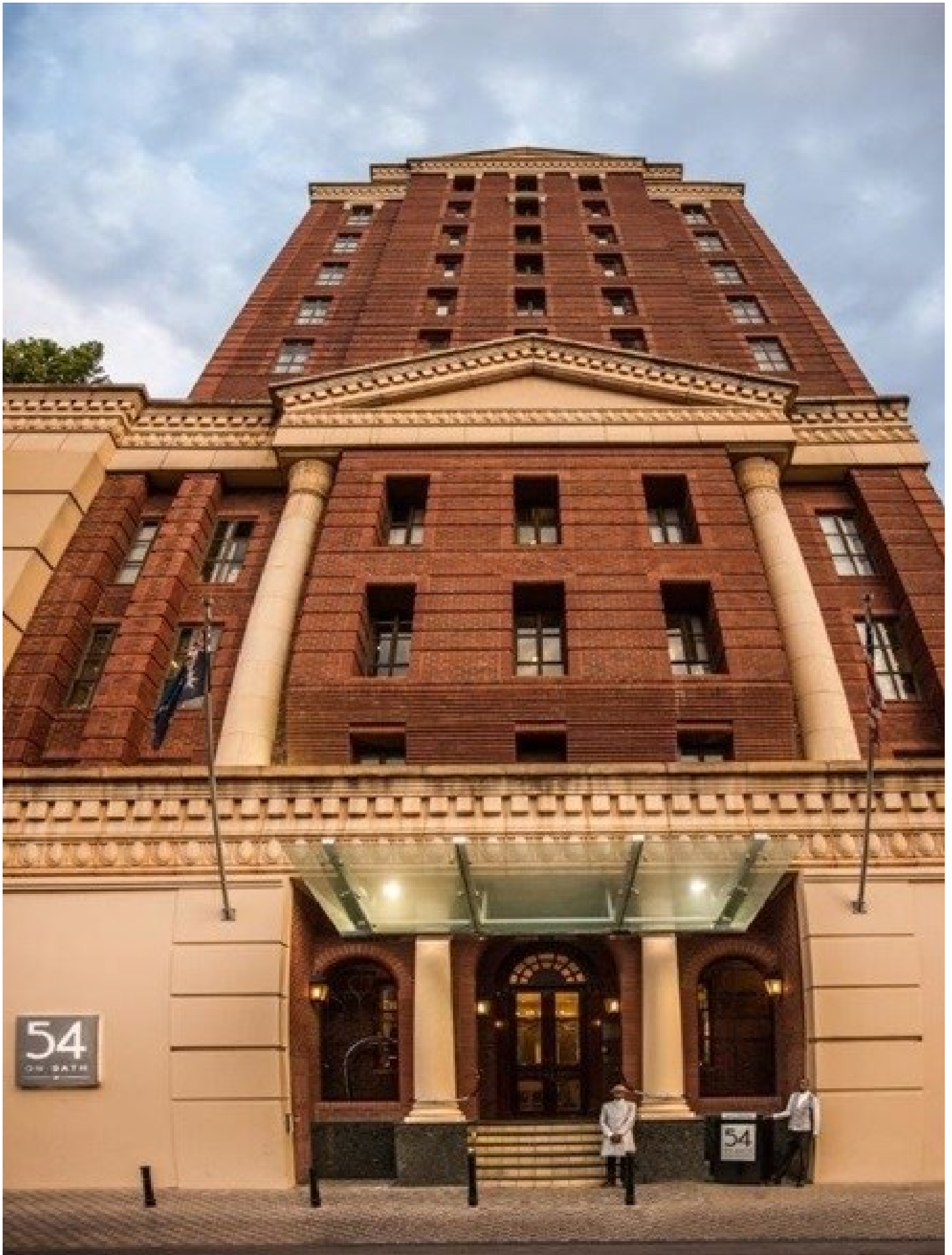
54 on Bath