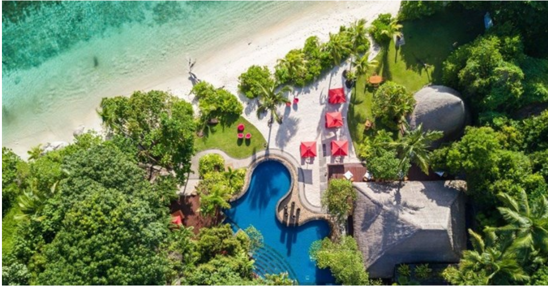
MAIA Luxury Resort & Spa aerial view

The TripAdvisor Certificate of Excellence celebrates hospitality businesses that have earned great traveler reviews on TripAdvisor globally over the past year. This year, 66 Certificate of Excellence awards were presented to a total of 66 Tsogo Sun properties in 36 regions across nine provinces and seven countries. 11 Tsogo Sun hotels and resorts have also won 2017 TripAdvisor Travelers Choice Awards.