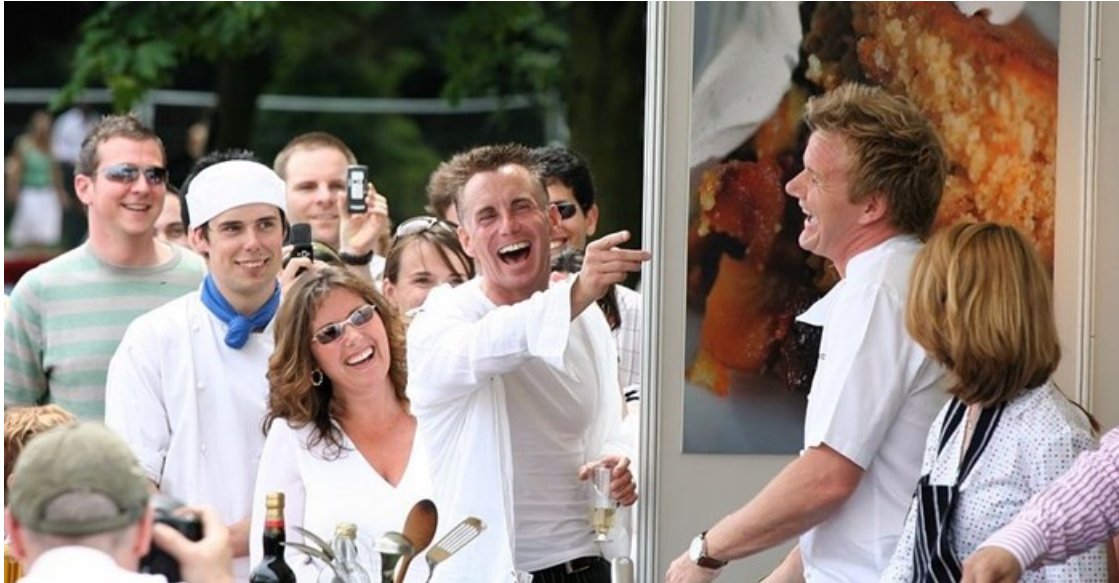
Celebrity chef Gordon Ramsay

Although the numbers won't be as great in the South African context, that there is a growth in eating out is a given. The growth in interest in food has also translated into a celebrity-chef culture, a plethora of recipe books and a concomitant increase in food-related media.