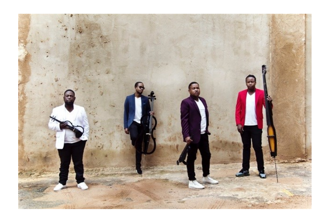
For more information and bookings please visit <u>www.urbanstrings.co.za</u>