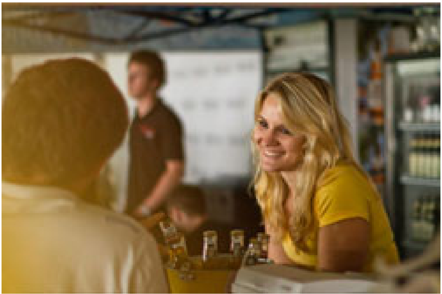
Like the embrace of a long lost friend