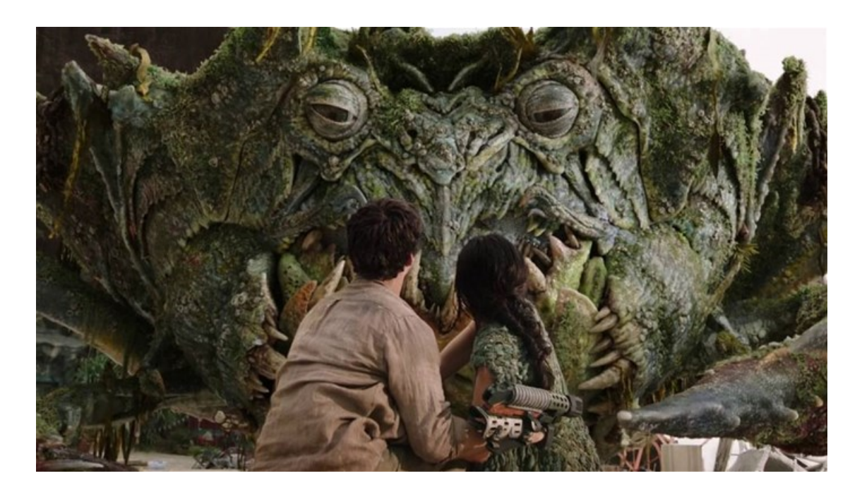
With films like Love and Monsters and Godzilla vs Kong, it emphasises an important function of filmmaking: escapism! Although it provides loads of escapism and first-rate entertainment, it has humanity at its core, poignantly and relevantly reflecting our human condition, particularly with the world gripped in the fear of a pandemic. Definitely! With bigger entertainment films, I feel like the themes you deal with the need to be very human and globally relatable.

In L&M , there's a message about facing your fears and learning about yourself by doing that. Following 'love' even if it takes you out of your comfort zone, will open the world up and you will learn and experience more. Following fear, you will not grow or have a positive effect on the world and those around you.