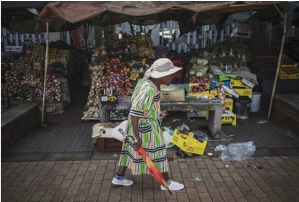
A woman walks past a market stall in Kliptown, Soweto.

Covid-19 has wrought havoc on poor households in countries across the world. In South Africa, more and more people are facing hunger resulting from mass job losses and small, poorly implemented supplementary cash grants.