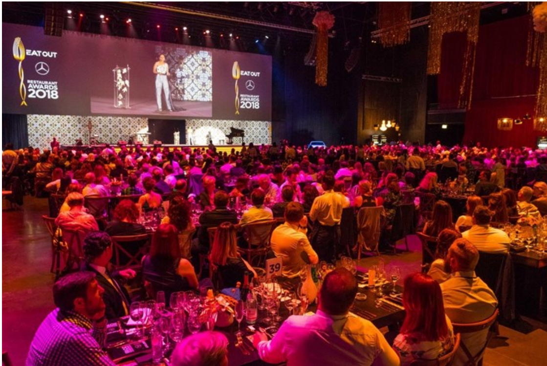
2018 Awards Ceremony

Eat Out will count down from 20 to 11 at the awards, which will take place at GrandWest in Cape Town on Sunday 17 November 2019, before finally revealing the Top 10 restaurants in the country.